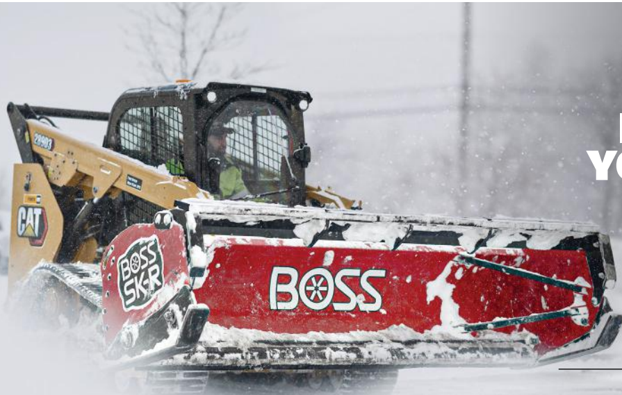
Optional backdrag equipment shown.