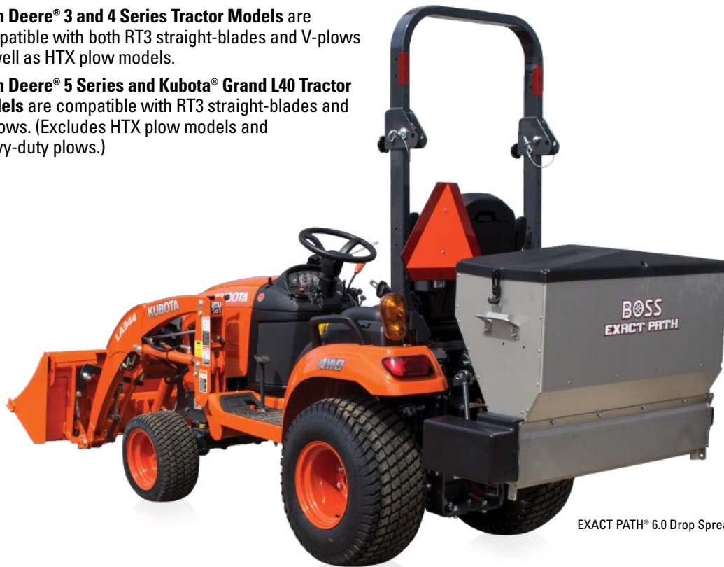
EXACT PATH® 6.0 Drop Spreader

John Deere® 5 Series and Kubota® Grand L40 Tractor Models are compatible with RT3 straight-blades and V-plows. (Excludes HTX plow models and heavy-duty plows.)