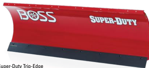
8' Super-Duty Trip-Edge Steel Skid Steer