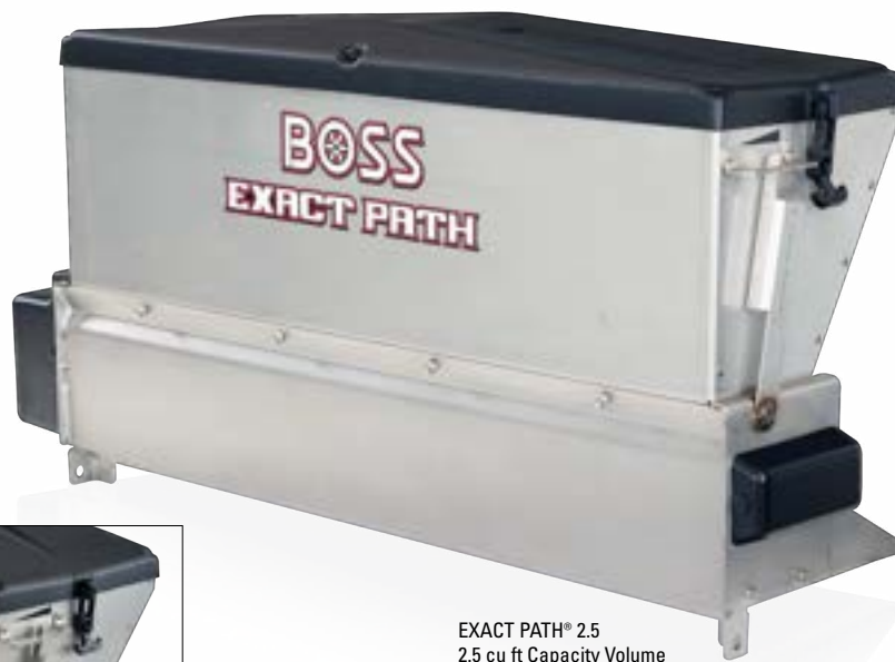
EXACT PATH® 2.5 2.5 cu ft Capacity Volume