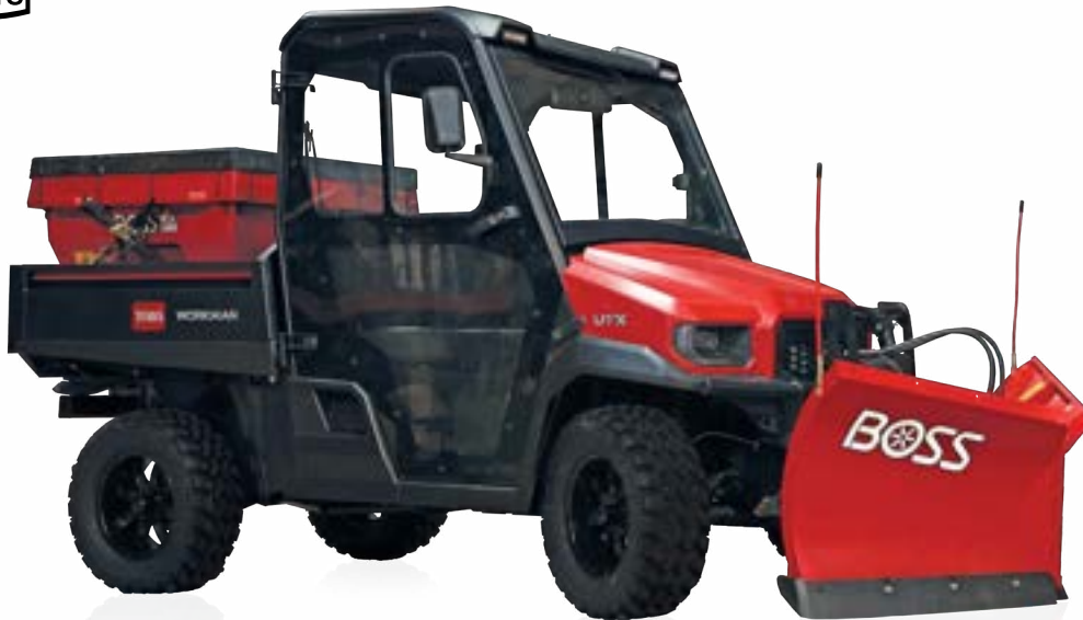
Toro® Workman® UTX equipped with XT Plow and VBX 3000