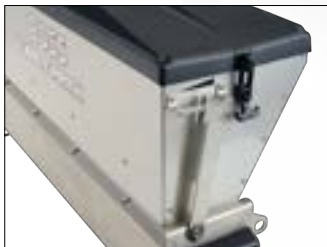
Adjustable Feed Gate Lever